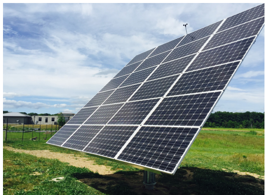
AllEarth Series-24 Solar Tracker, 24 285 W SolarWorld modules, Fronius Primo 7.6 kW inverter, 6.84 kW DC

Get more from the sun with the AllEarth Power Curve Advantage.